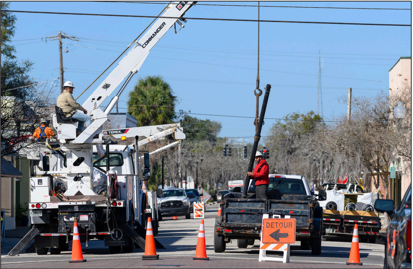
Contractors working for Florida Power and Light replace streetlights on St. Johns Avenue in Palatka on Wednesday.